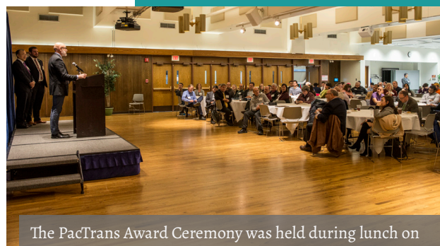
The PacTrans Award Ceremony was held during lunch on October 12 along with a concurrent poster session....

CSET has been funded through the 2016 University Transportation Center Program by the US Department of Transportation as part of the FAST Act at approximately $1.4 million in each of the next five years.