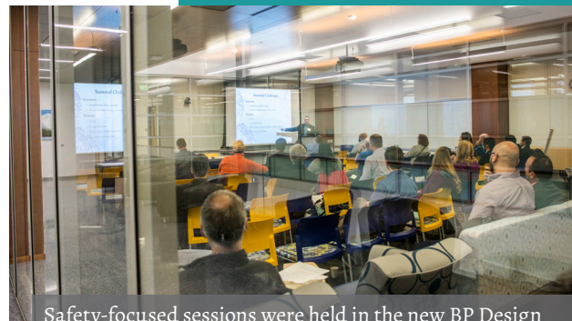
Safety-focused sessions were held in the new BP Design Theater in the Engineering Learning and Innovation Facility.