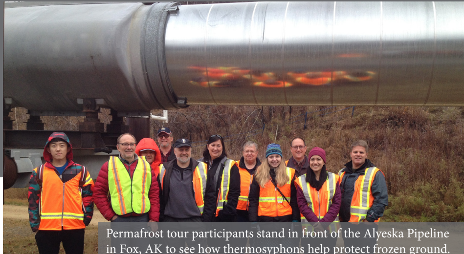
Permafrost tour participants stand in front of the Alyeska Pipeline in Fox, AK to see how thermosyphons help protect frozen ground.

The University of Alaska Fairbanks is actively seeking graduate students interested in research related to rural, isolated, tribal and indigenous transportation safety. Civil engineering is preferred, but also looking for interdisciplinary and Alaskan Native students. For more information contact Nathan Belz at npbelz@alaska.edu .