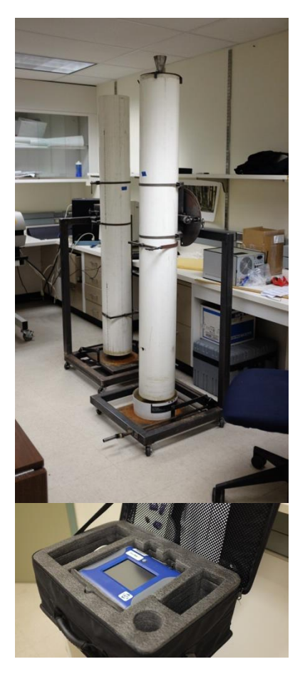
Figure 2-1. The dustfall column and the aerosol sensor used to record data for the UAFDUST application.

The data for use in the UAFDUST application comes from a combination of a dust- fall column and an aerosol sensor. We used a TSI Dusttrak II sensor (TSI Incorporated, 2020). Figure 2-1-1 shows the dustfall column and the aerosol sensor. The source data is raw text recorded by the dust sensor as the dust falls inside the dustfall chamber. Sample data are shown in Appendix A. We get two columns of information. The first column is the time measured in seconds and the second column is the concentration C measured in mg/m^3 . For this document, we will use the sample data as the source for example graphs and calculations. Figure 2-2 shows a plot of the sample data from Appendix A.