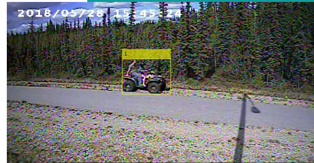
ATV operating unlawfully on multiuse path with passenger in Fairbanks, AK

CSET has positions open for post-doctoral researchers, graduate and undergraduate students interested in RITI transportation equity and safety research. Please contact us at cset.utc@alaska.edu .