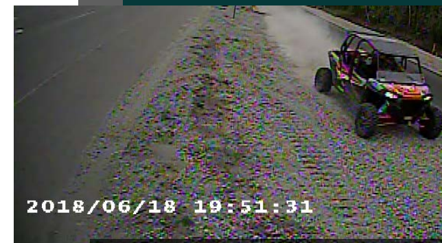
UTV operating lawfully in right-of-way in Fairbanks, AK

CSET has been funded through the 2016 University Transportation Center Program by the US Department of Transportation as part of the FAST Act at approximately $1.4 million through 2022.