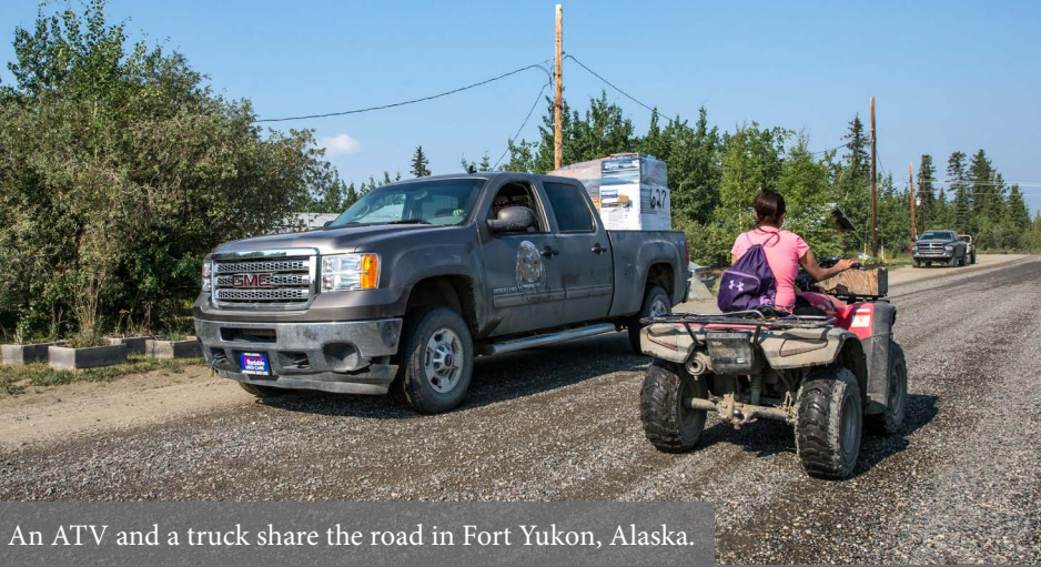
An ATV and a truck share the road in Fort Yukon, Alaska.

Nationally, 20% of ATV riders frequently operate their vehicles on paved roads. 62% of ATV-related deaths between 1985 to 2009 resulted from on-road crashes. 77% of injuries suffered while operating an ATV happen to drivers under the age of 35. 94% of ATV users ride with more than one person despite being on vehicles only designed for one user.